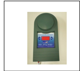
AHT Heat pump Control

MS3D – The traditional Solar controller, tried and true available now ex stock.