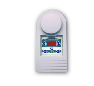
MS3D Solar Controller

Ascon Pool Products showcased 2 of our most popular products and 2 new products recently released to the market.